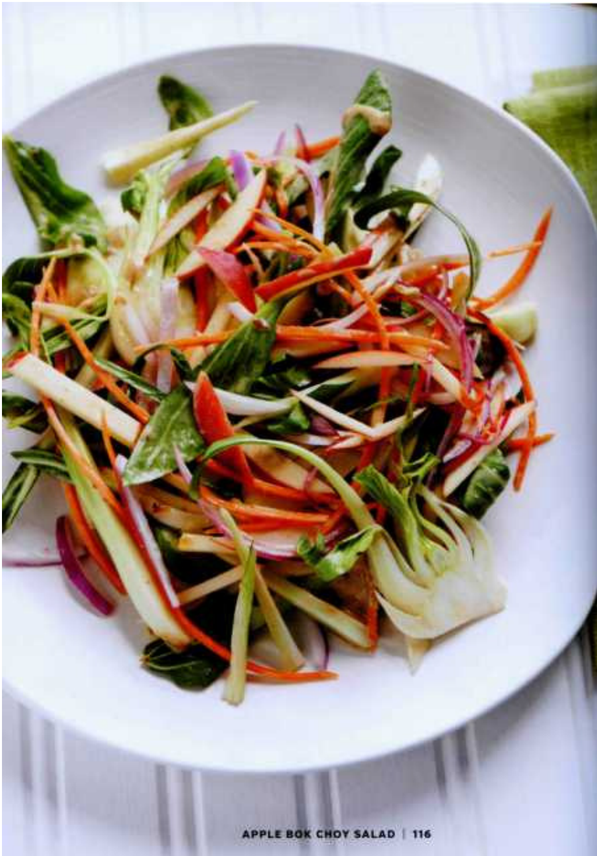
APPLE BOK CHOY SALAD | 116