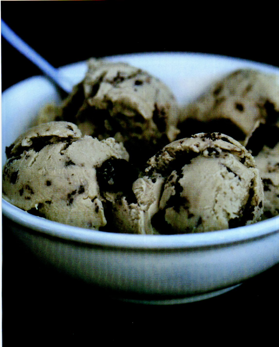
Chocolate Chip-Maple Maca Ice Cream (page 285)