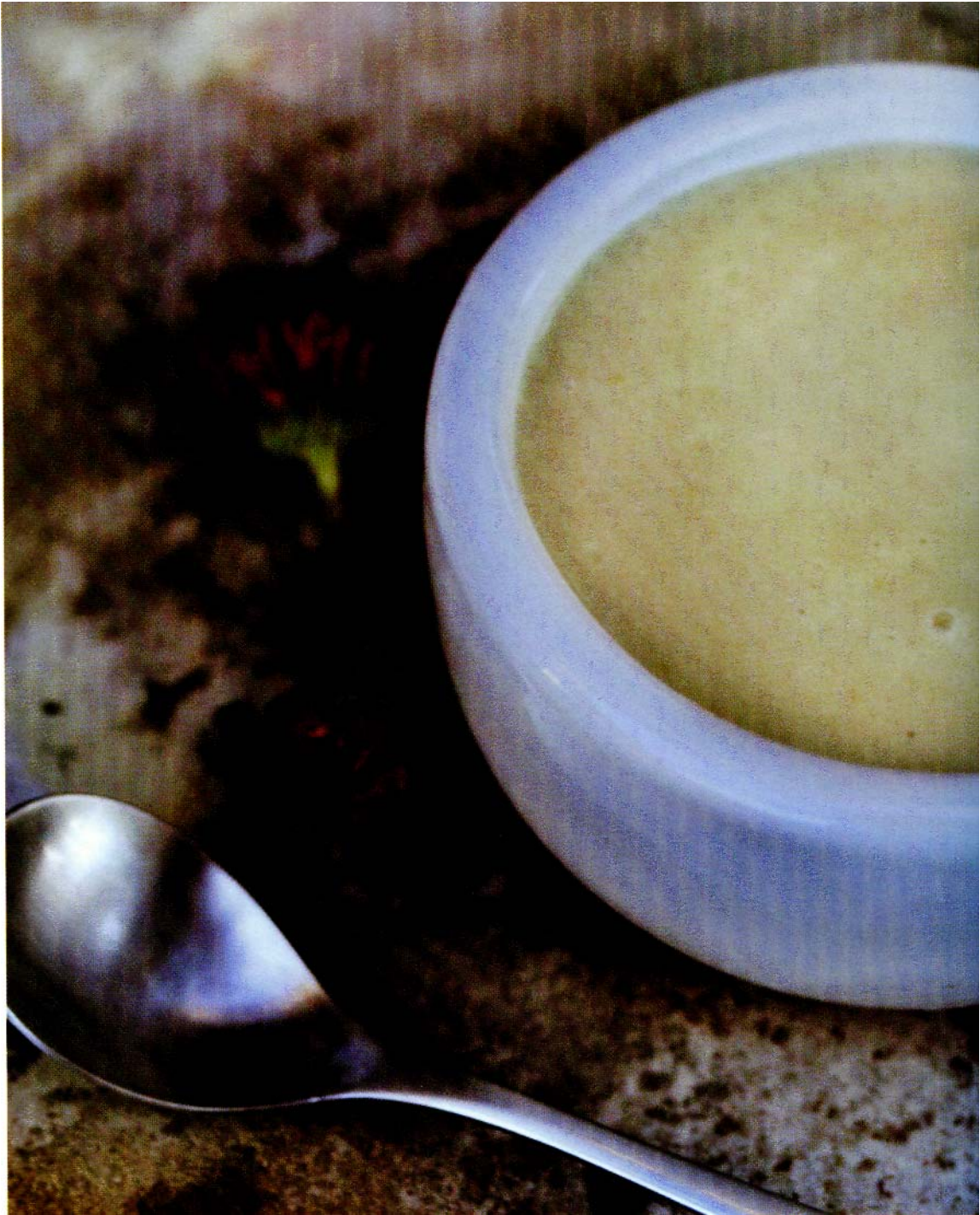
Young Coconut Soup (page 175)